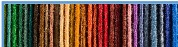
St. Augustine's Family Feedback Form 2024